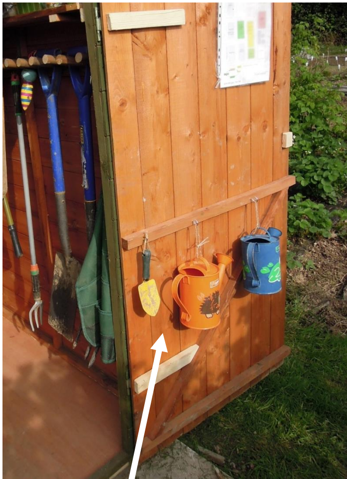
Children's tools within reach