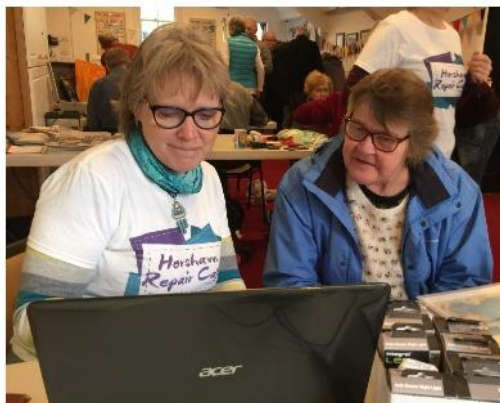
Feb 2020 Horsham Repair Cafe also offers free energy cost comparisons

www.HorshamClimateCafe.org.uk topical event